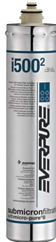
i500 Replacement Cartridge: EV9612-24

Everpure water treatment systems (excluding replaceable elements) are covered by a limited warranty against defects in material and workmanship for a period of five years after date of purchase. Everpure replaceable elements (filter cartridges and water treatment cartridges) are covered by a limited warranty against defects in material and workmanship for a period of one year after date of purchase. See printed warranty for details. Everpure will provide a copy of the warranty upon request.