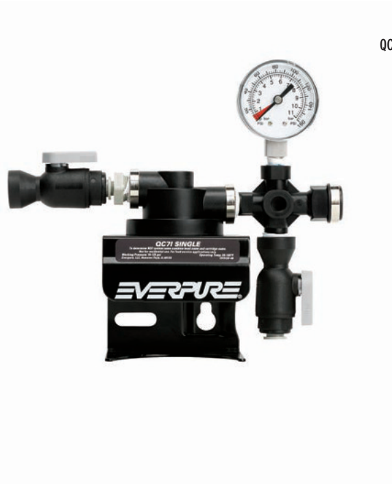
QC7I Single Head: EV9272-41

Filter head exclusively for Everpure replacement cartridges